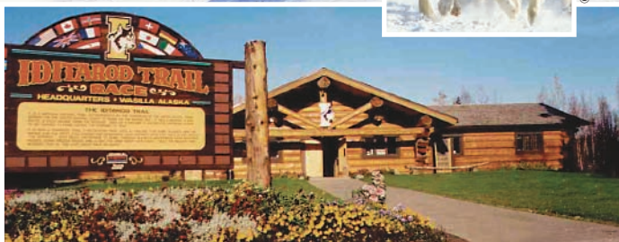
Iditarod Trail Headquarters, Wasilla, Alaska