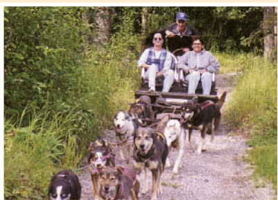
Dog sled riders take a thrilling trail ride.